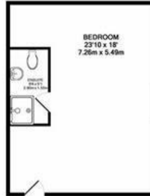
2ND FLOOR APPROX. FLOOR AREA 429 SQ. FT. (39.9 SQ. M.)

GROUND FLOOR APPROX. FLOOR AREA 1292 SQ. FT. (120.0 SQ. M.) TOTAL APPROX. FLOOR AREA 2818 SQ. FT. (261.8 SQ. M.) Whilst every attempt has been made to ensure the accuracy of the floor plan contained here, measurements of doors, windows, rooms and any other items are approximate and no responsibility is taken for any error, omission, or mis-statement. This plan is for illustrative purposes only and should be used as such by any prospective purchaser. The services, systems and appliances shown have not been tested and no guarantee as to their operability or efficiency can be given. Made with Metropix ©2015