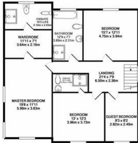
1ST FLOOR APPROX. FLOOR AREA 1097 SQ. FT. (101.9 SQ. M.)